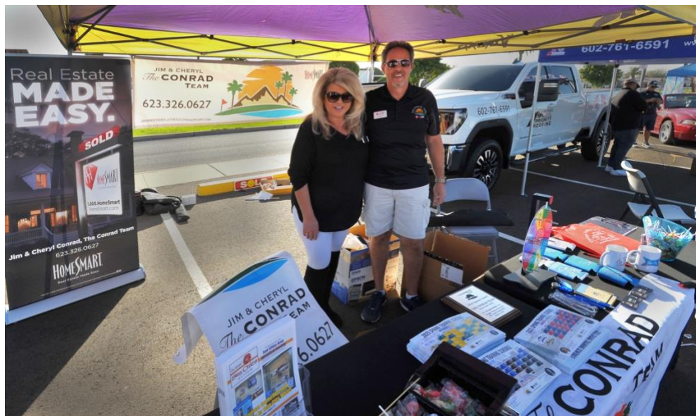
The Conrad Team Spring Fling Silver Sponsor (and a pretty cool couple)