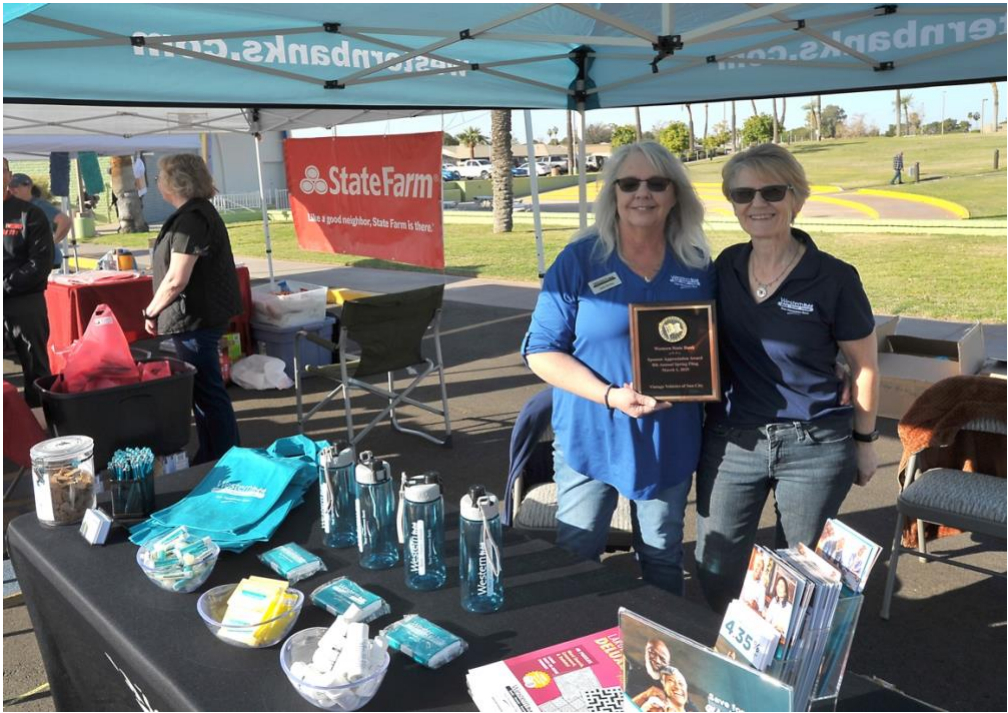
Western State Bank