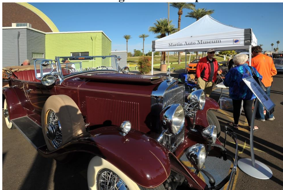
Martin Auto Museum