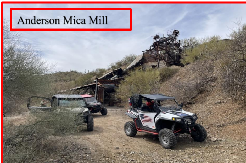
Anderson Mica Mill

We rode Jackass Flats north of Morrystown.