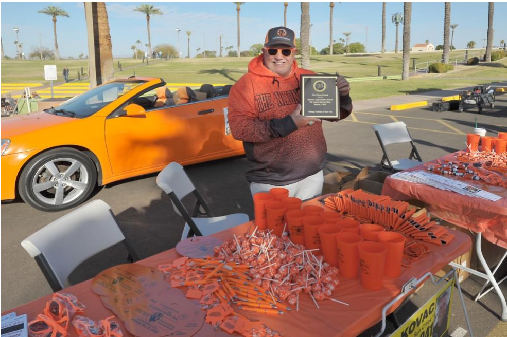
The Nixon Group