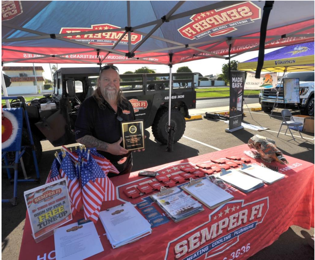
Semper Fi Heating and Cooling