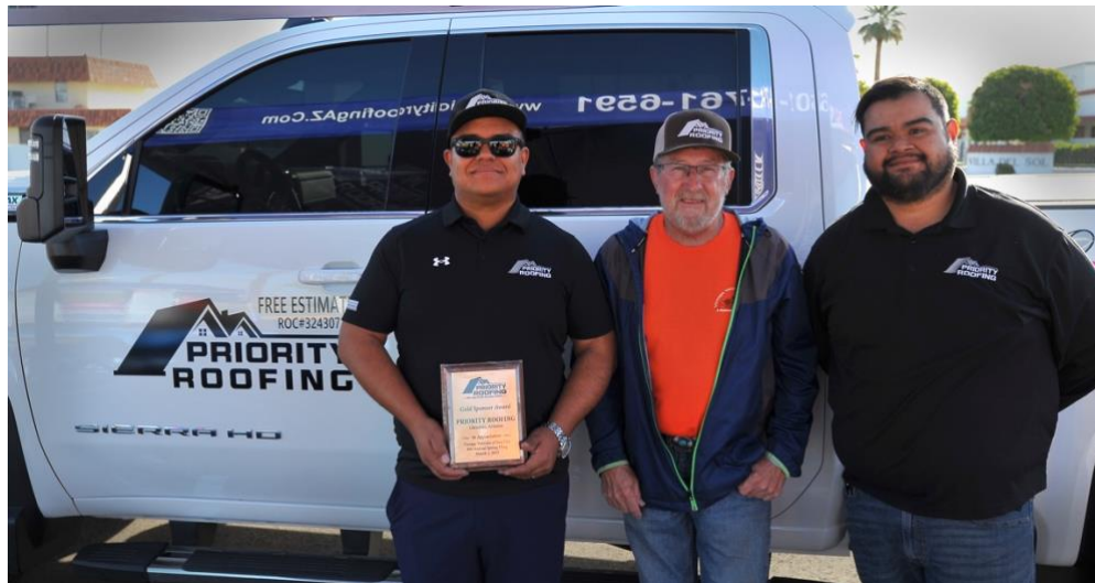
Priority Roofing Spring Fling Gold Sponsor