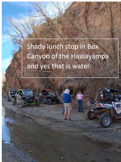
Shady lunch stop in Box Canyon of the Hassayampa and yes that is water.