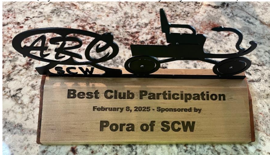
Best Club Participation Award Displayed at the shop