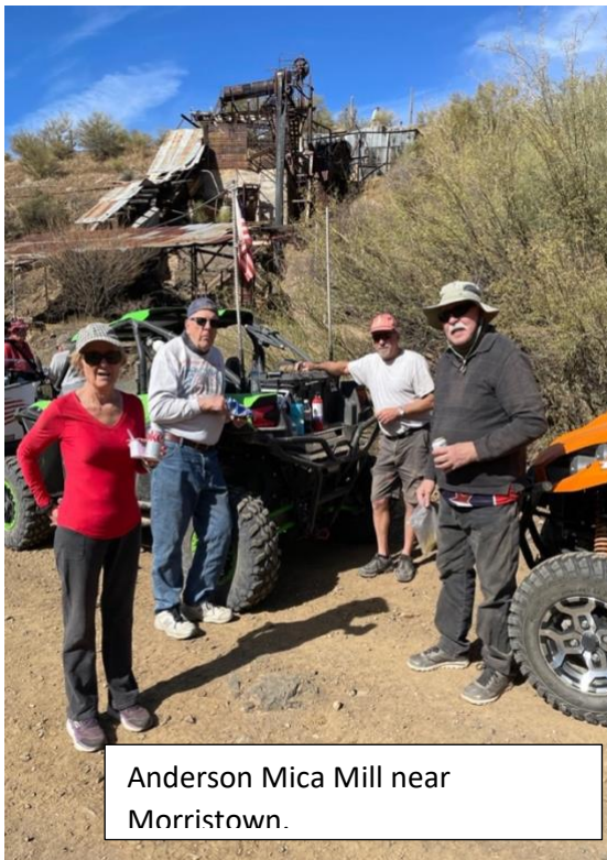
Anderson Mica Mill near Morristown.