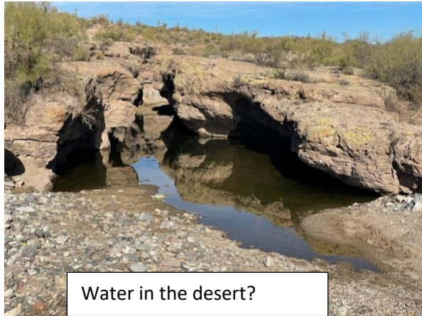
Water in the desert?