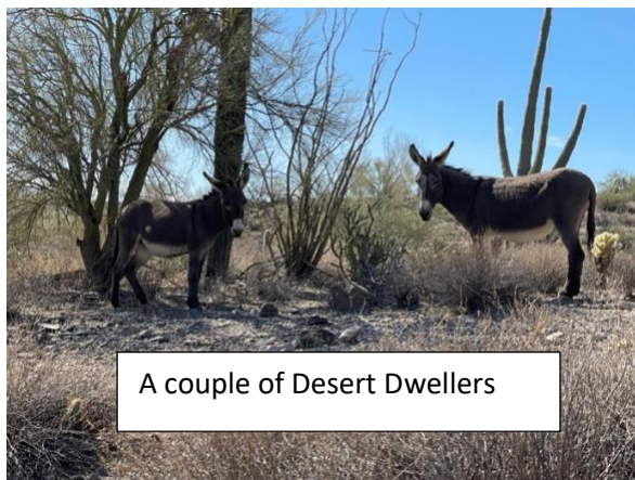
A couple of Desert Dwellers