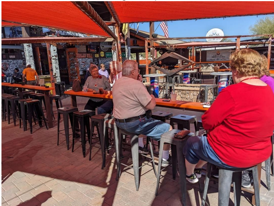
Covered Patios at the Road House.