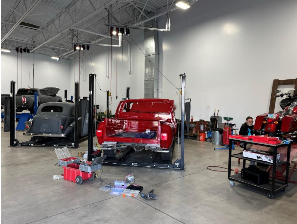
Joe Sanders' pick-up is back from the paint shop, looking good!