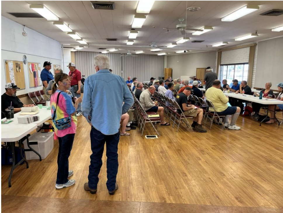
Membership meeting February 20