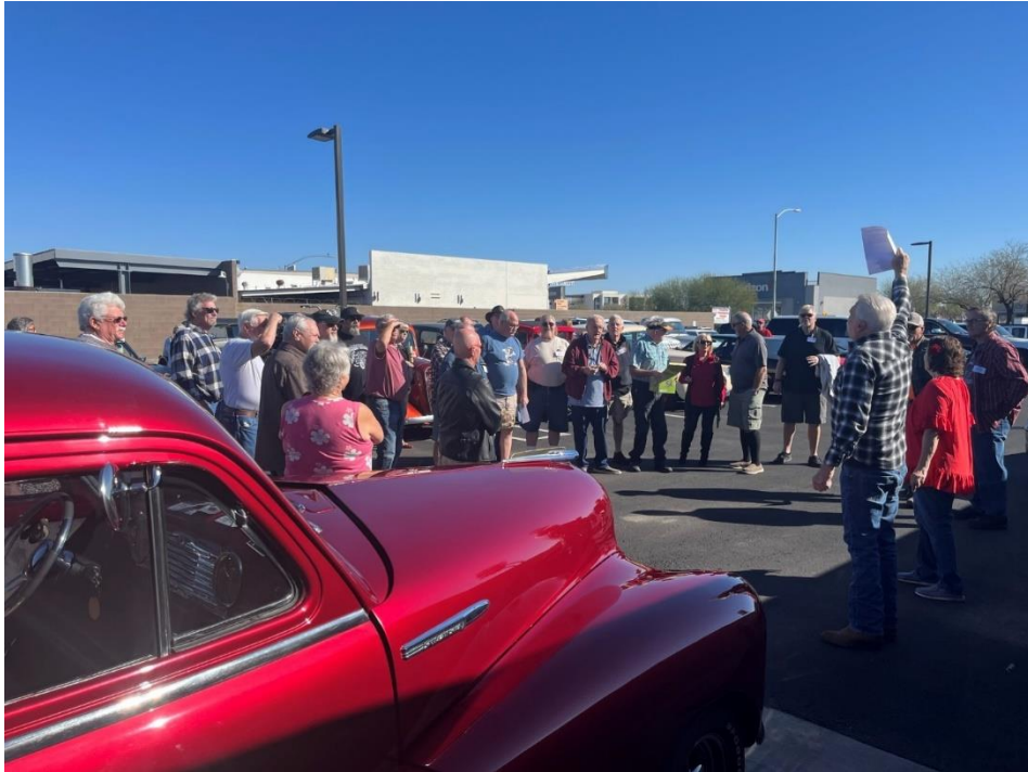
Drivers Meeting before leaving on the first run. There were over 50 signed up.