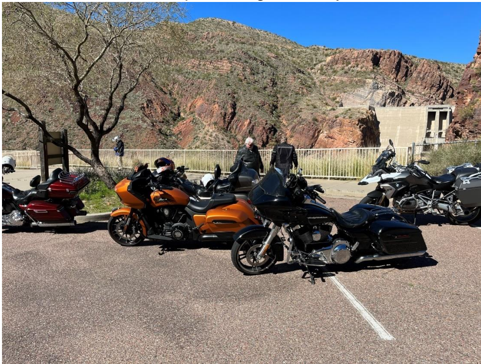
The Vintage Riders at the Roosevelt Lake Dam Thurs. Feb 22