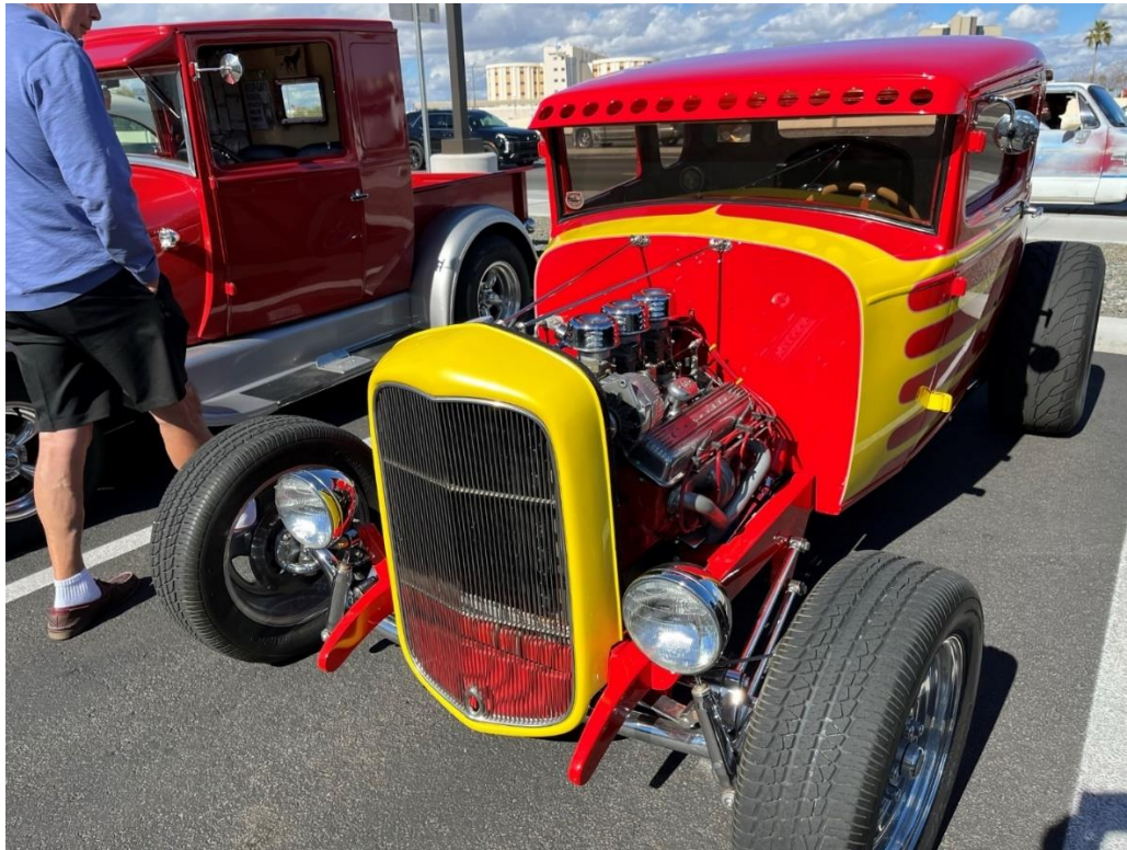
Grand Center Car Show and Cruise-In Feb 3.