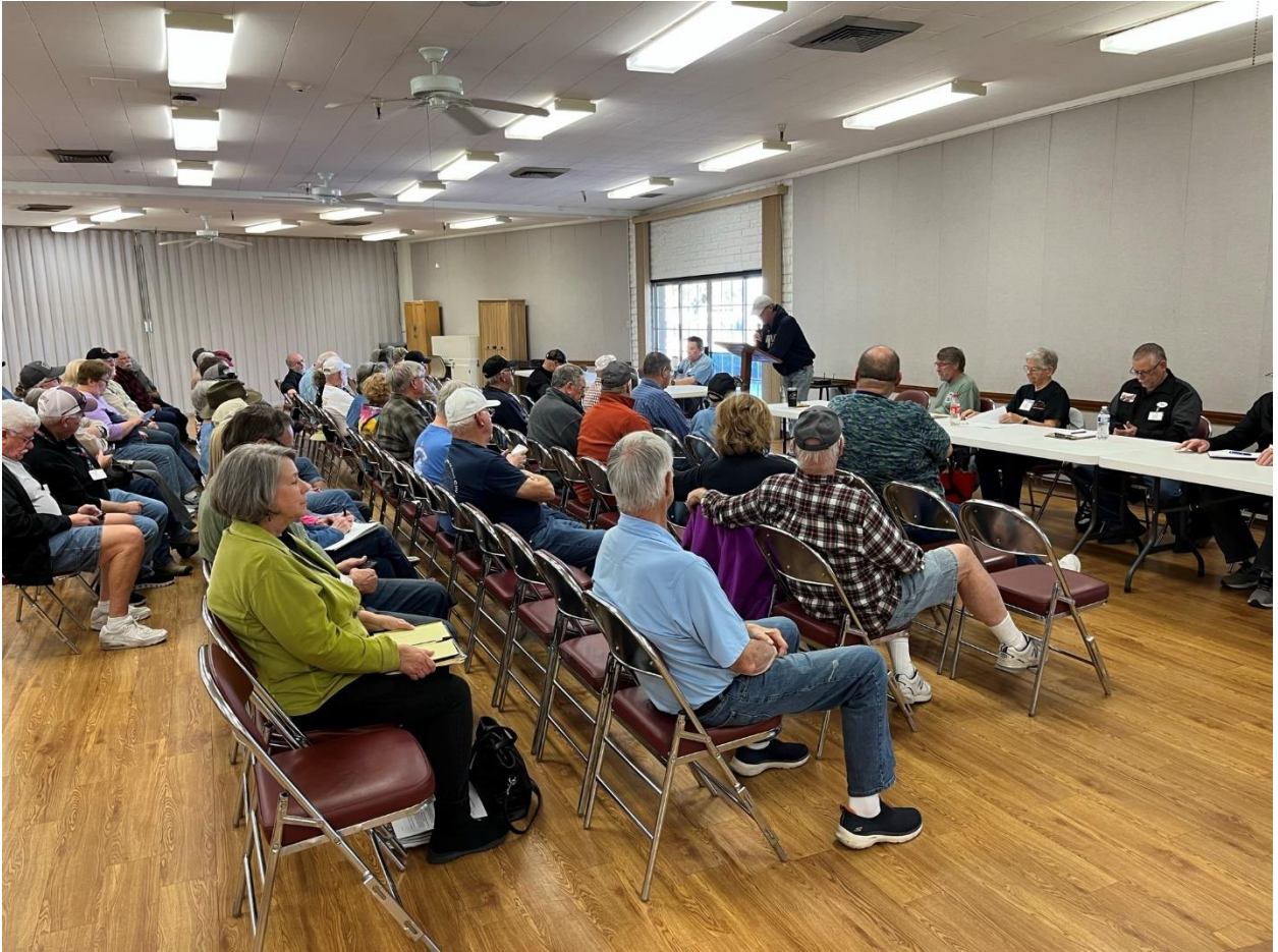
Membership meeting January 16

Get Involved! Participate in your Club! Meet new people!