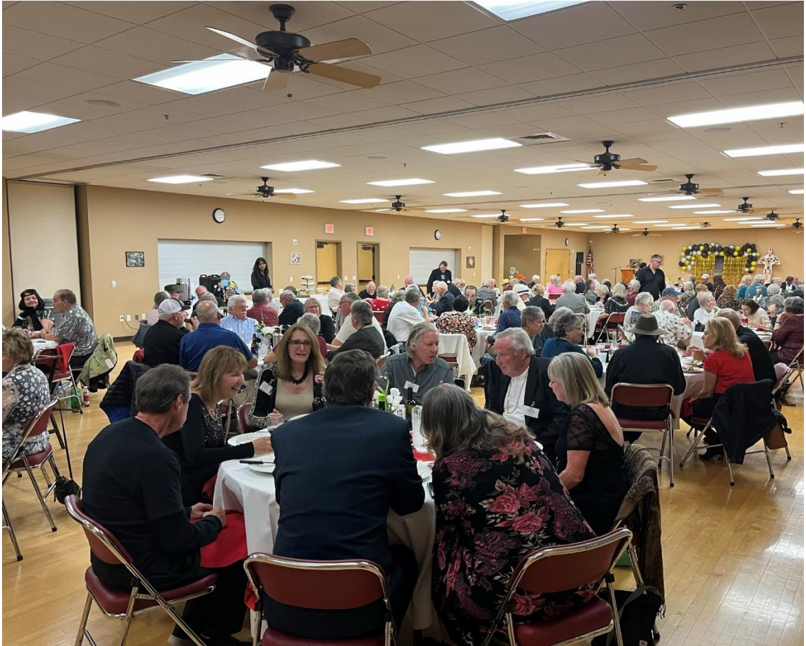
A wonderful plated meal was catered by Classic Catering.