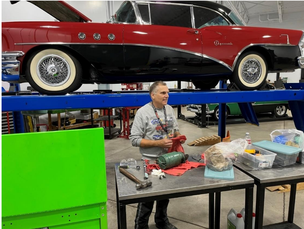
Replacing the frost plug!