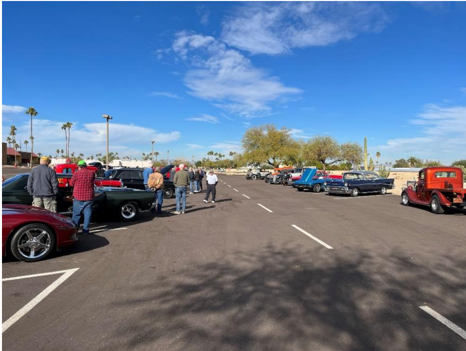
Friday January 5 th Car Show at Bell Center