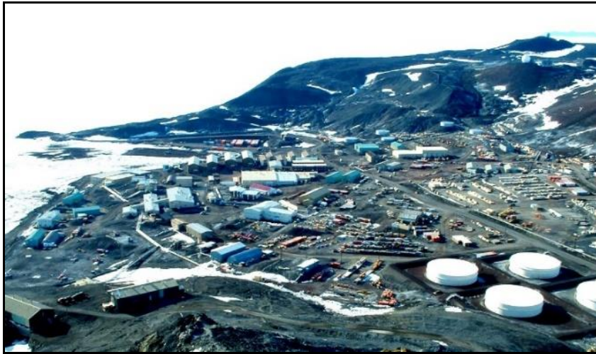
McMurdo Station, South Pole, Antarctica