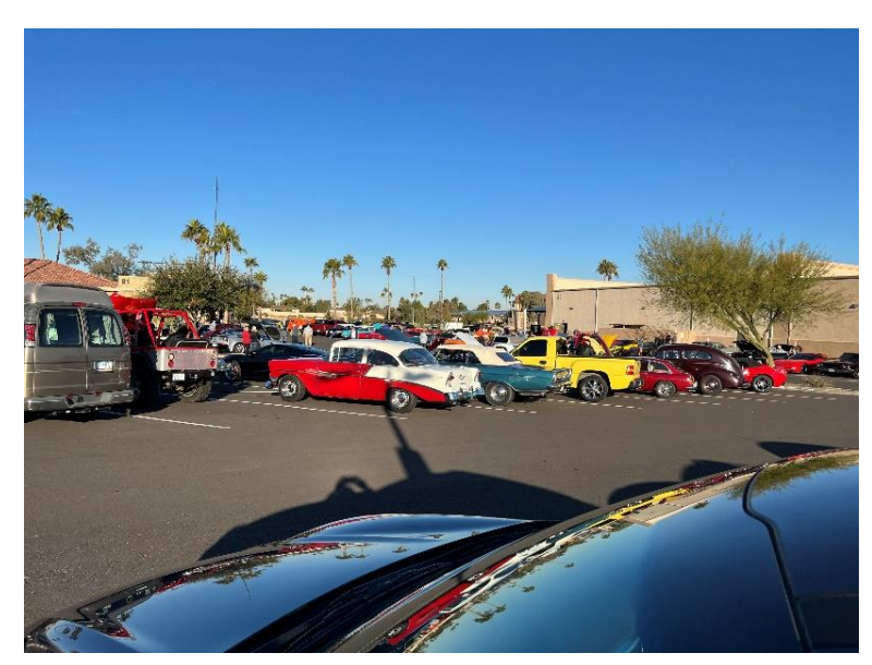
About 70 Cars Attended