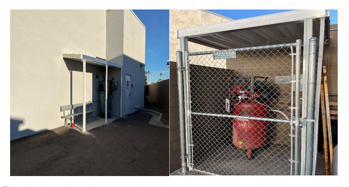
The shelters have been completed to protect the two shop compressors. Thanks RCSC!