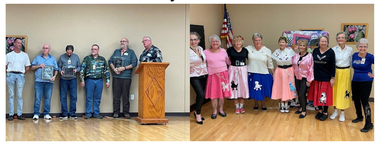
<u>Left</u> – Awards Presentation, Thank you for all your hard work! <u>Right</u> – "50's Poodle Skirt" was the theme for the event. Lots of fun!