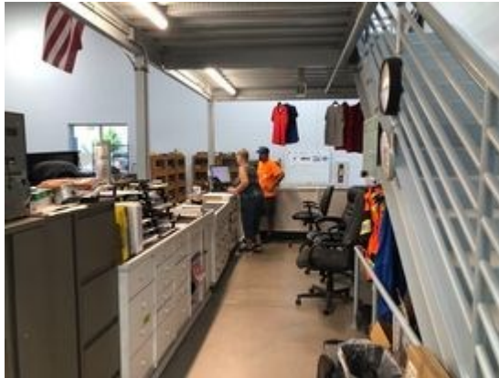
The monitor station being monitored