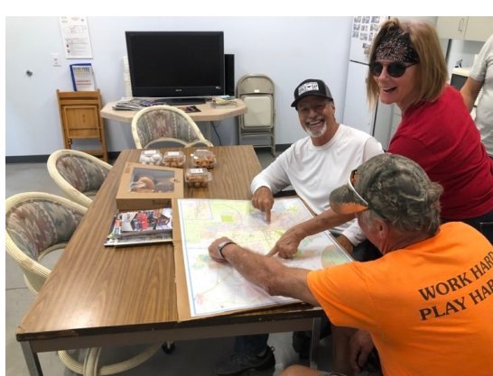
Members and friends “discuss” the ride destination