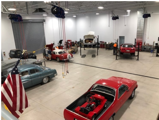
A view from the balcony