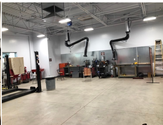
The new fabrication shop