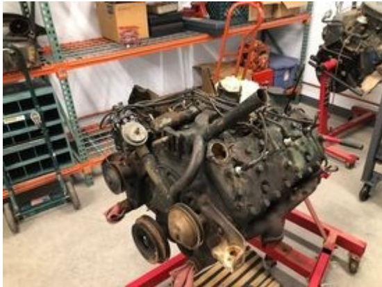
Engine rebuilds abound