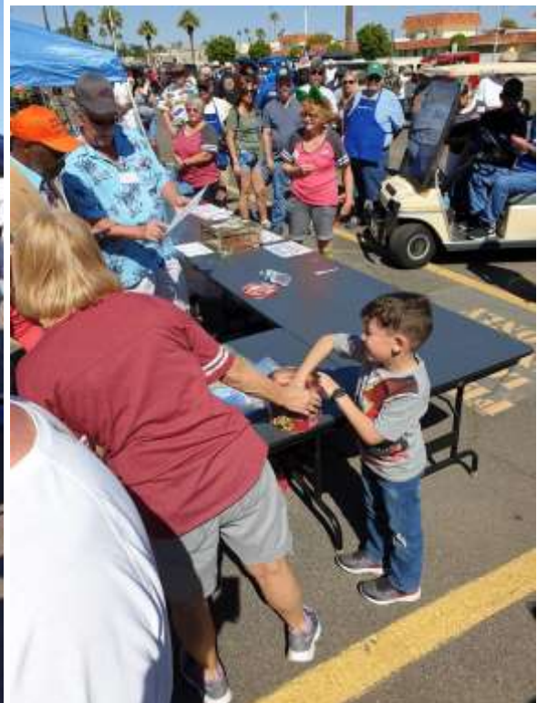
Drawing for raffle prizes