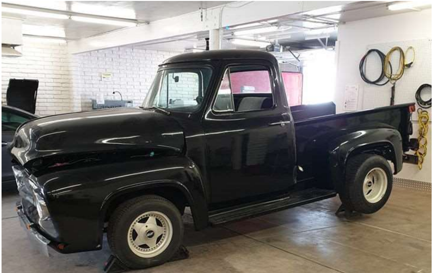
Members are working on the 2021 Car Raffle.... A 1954 Ford Truck. Drawing to take place at the March 2021 Spring Fling Car Show.