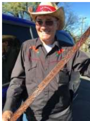
Our favorite jackass