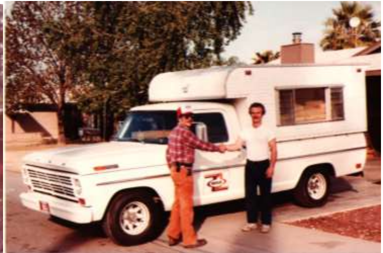
First Arizona vehicle was this 1968 Ford truck.