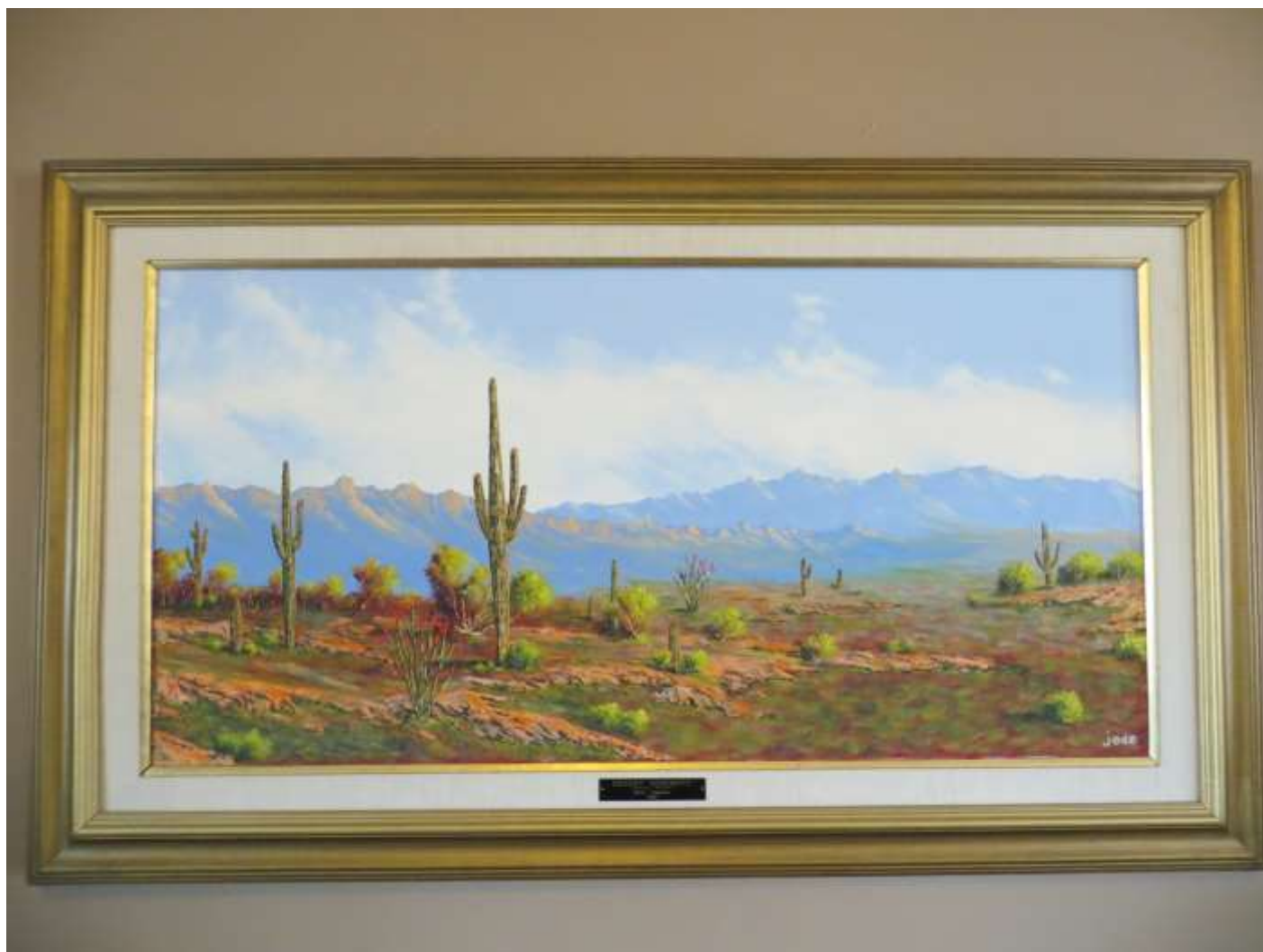
My favorite painting