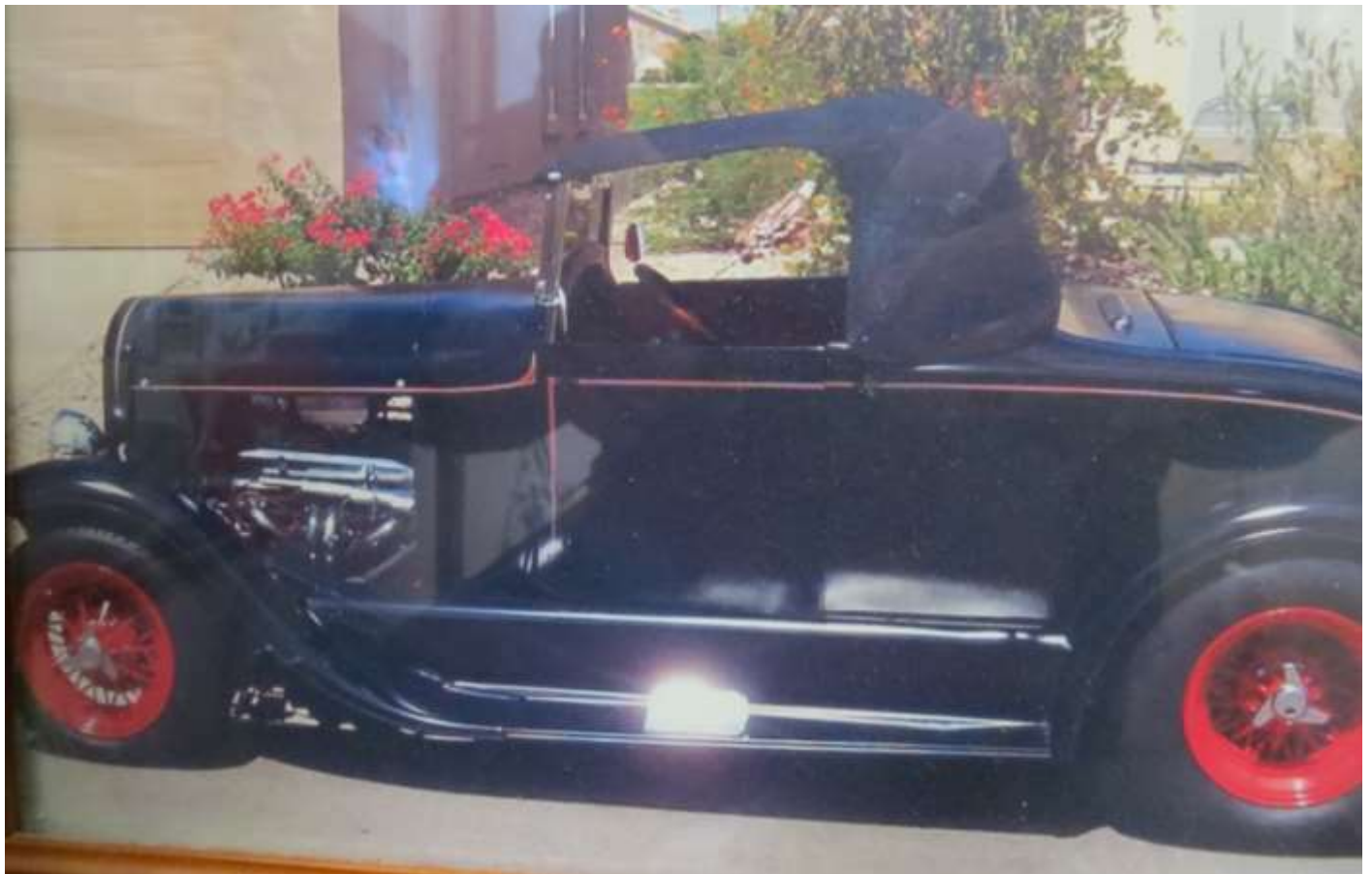
1929 Ford Roadster