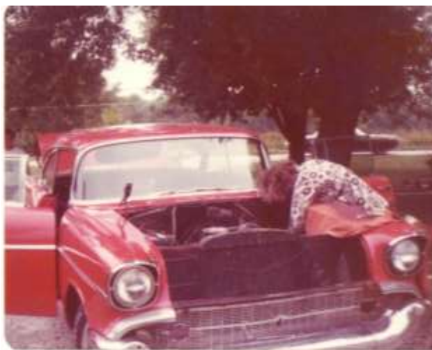
Working on the 1957