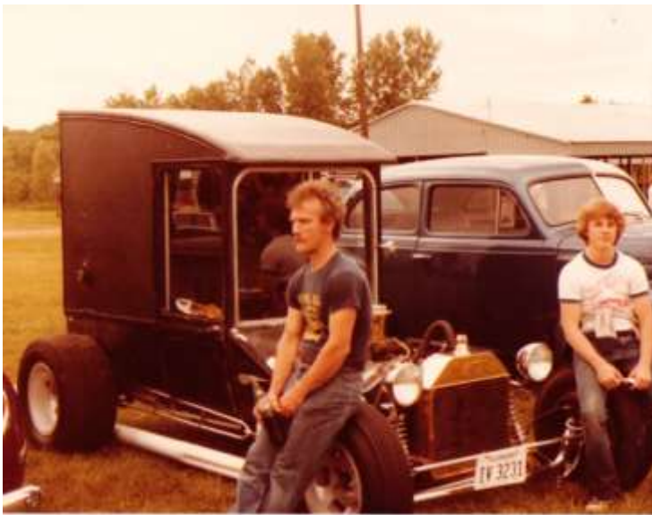
Traveling in the 1914 was a family affair.