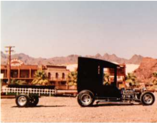
Traveled to many Rod Runs