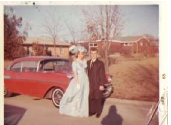
The 1957 was a daily driver.