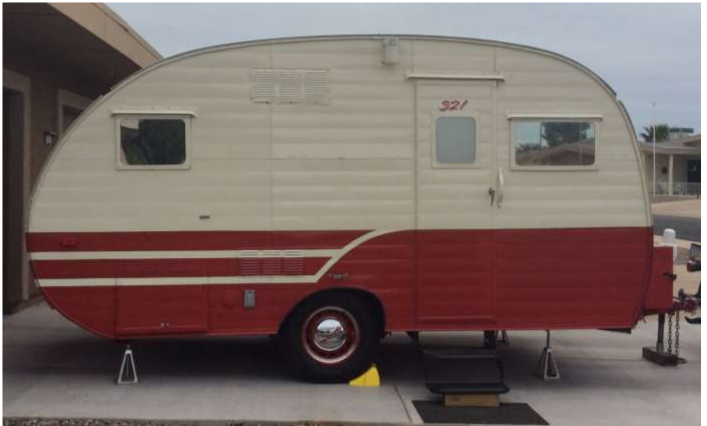
1948 La Cabana