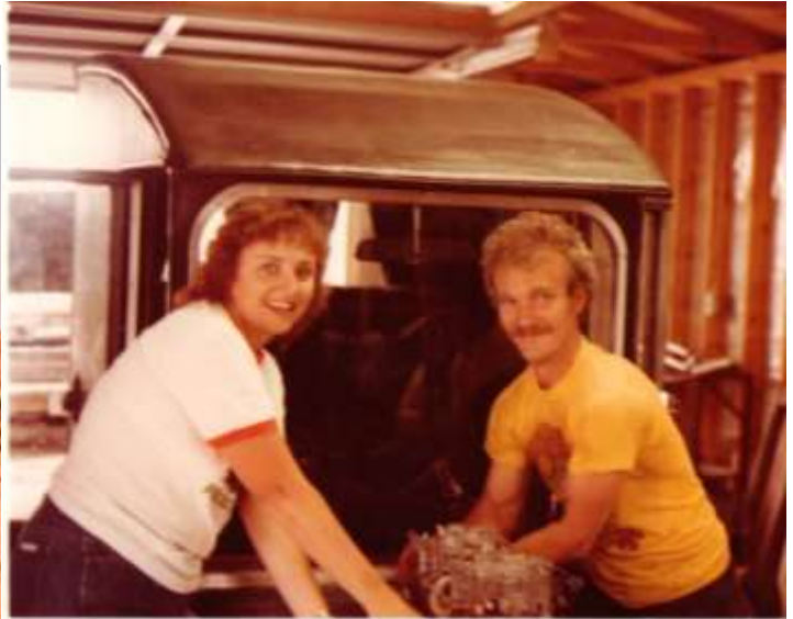
We worked on the 1914 together.