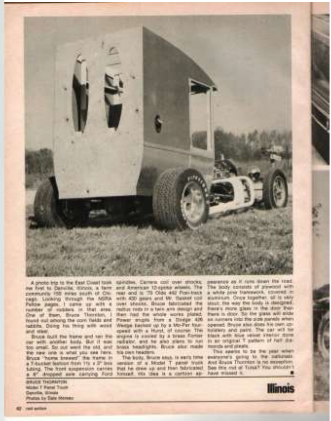
The 1914 article in Rod Acton magazine.