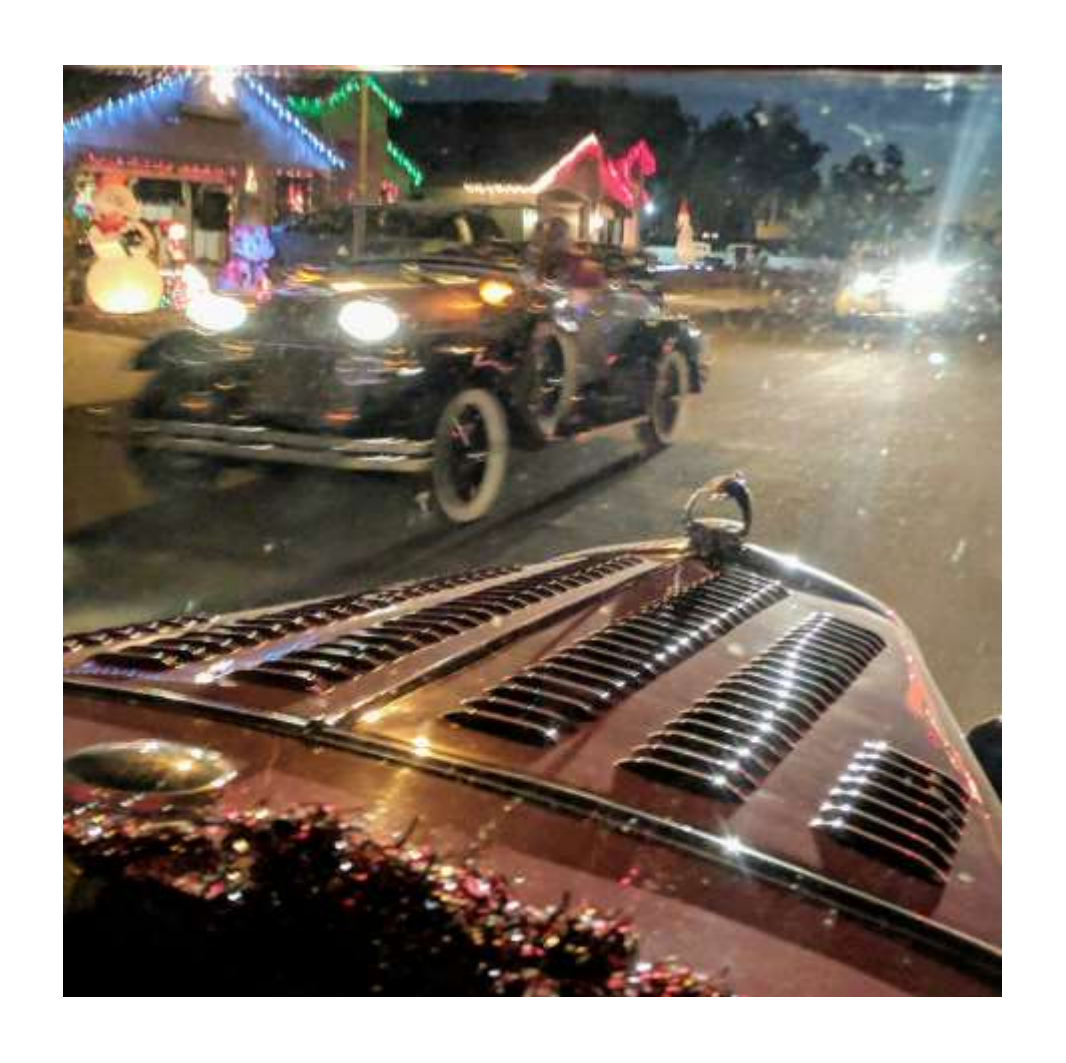
Its Your Club ..... Participate ..... Here's how:

Sign up to monitor in the shop. Provide articles for the Newsletter. Sell raffle tickets for the Corvette. Help solicit items for the March Car Show goodie bags. Sign up to help at the March Car Show. There are many areas that can use your help at the car show – Parking; Registration; Helping at the booths selling raffle tickets for the prizes; selling club shirts, etc. everyone help only 1 or 2 hours