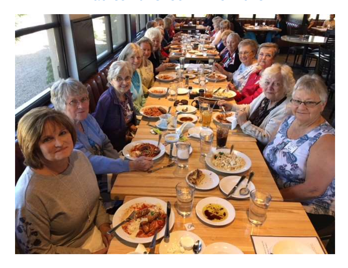
20 of the Ladies enjoyed a delicious lunch at Babbos Restaurant. The ladies also participated in Babbos Toys for Tots.

Starting a new section – Favorite recipes. Any ladies or gents out there want to provide a favorite recipe for the next newsletter?