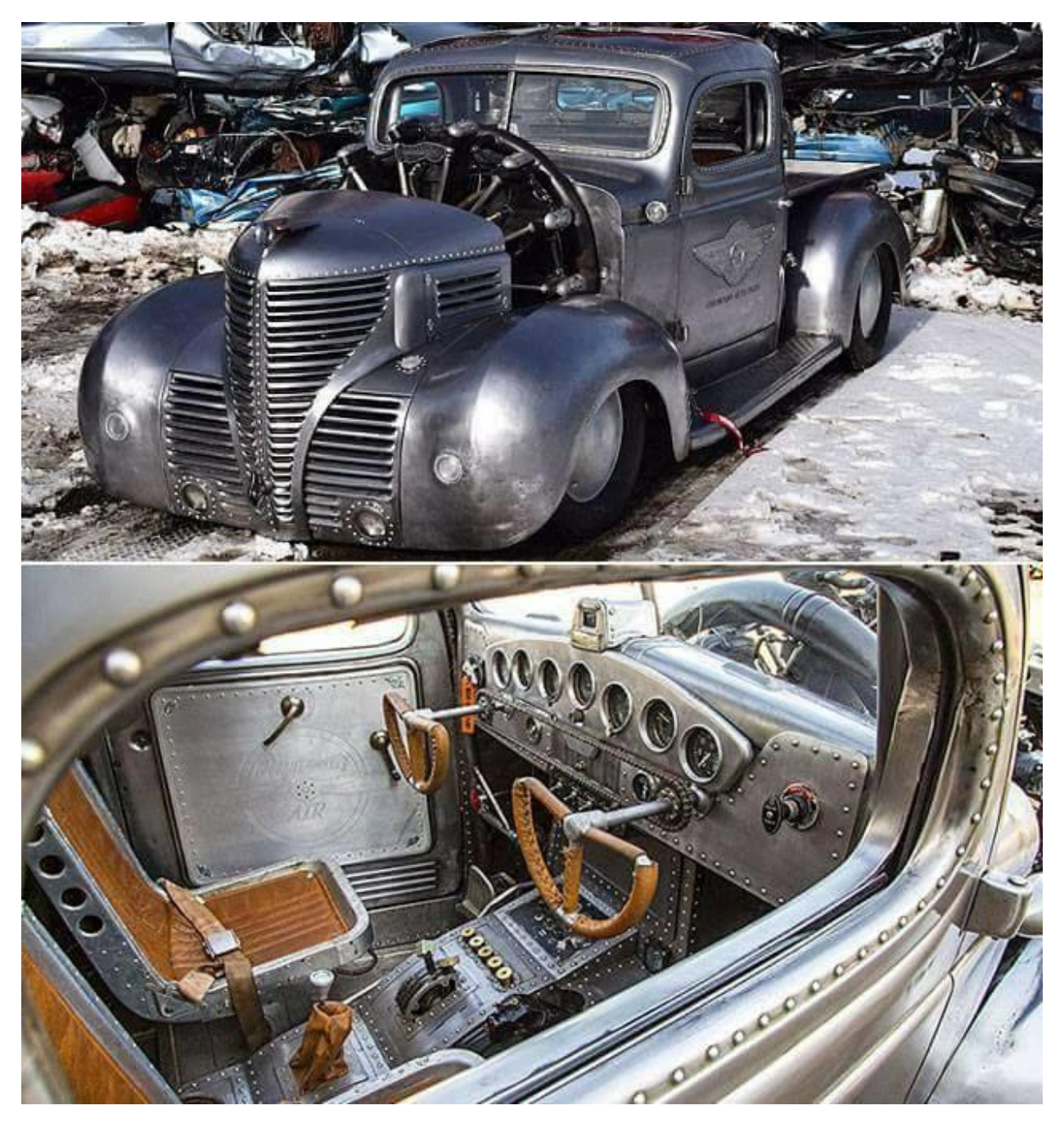
Can anybody identify this engine?