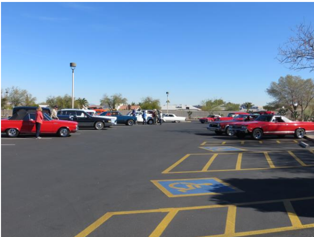
More of the participating cars