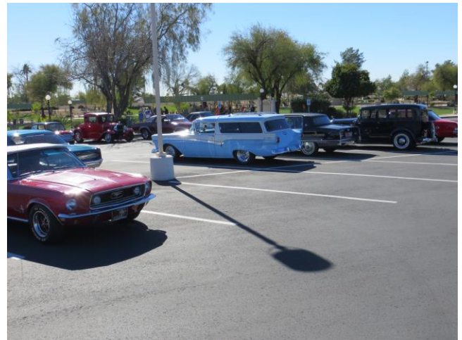
Some of the VVSC vehicles at Beardsley Park