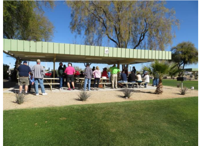
Members meet up before cruising to the ceremony

The celebration also allowed attendees the opportunity to walk through the new ARC shop. ARC also provided pop corn, hot dogs, and root beer floats to all that attended. Following the dedication ceremony, a live band played for the folks who stayed for the Sock Hop. Following are a few of the photos that were taken by Ed Gordon.