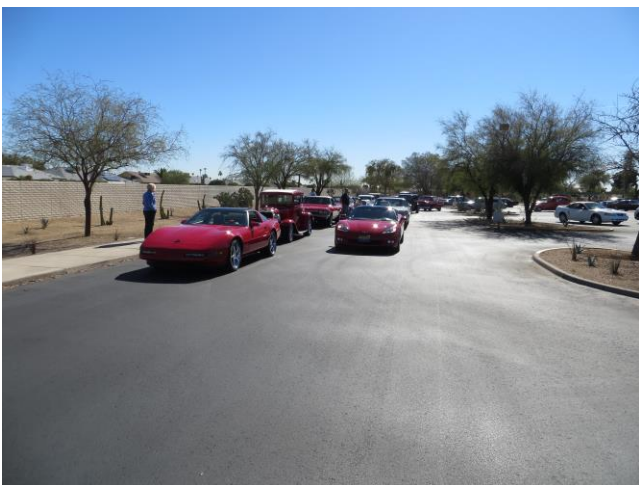
All lined up and ready to go to the ARC ceremony