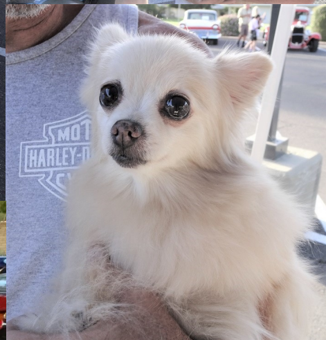
Ed Gordon's dog wants your love