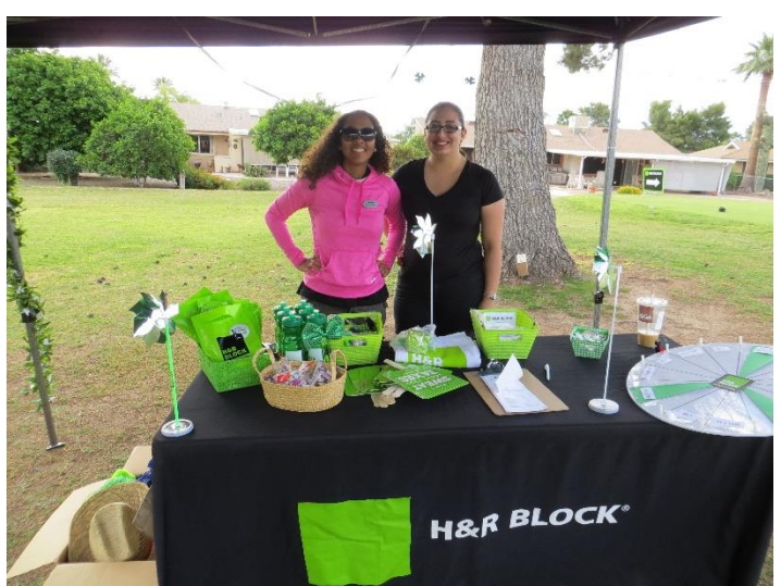
2016 VVSC Golf Tournament Winners

Vintage Vehicles of Sun City, Arizona Email: vvsuncity@outlook.com