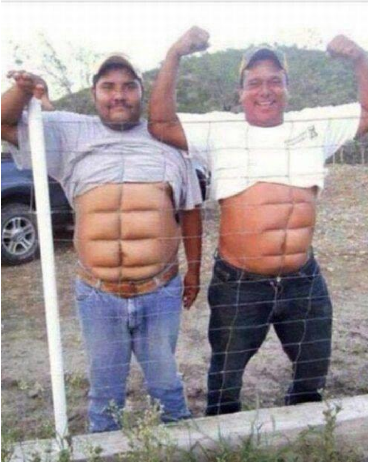
Instant six-pack abs. No need to give up beer