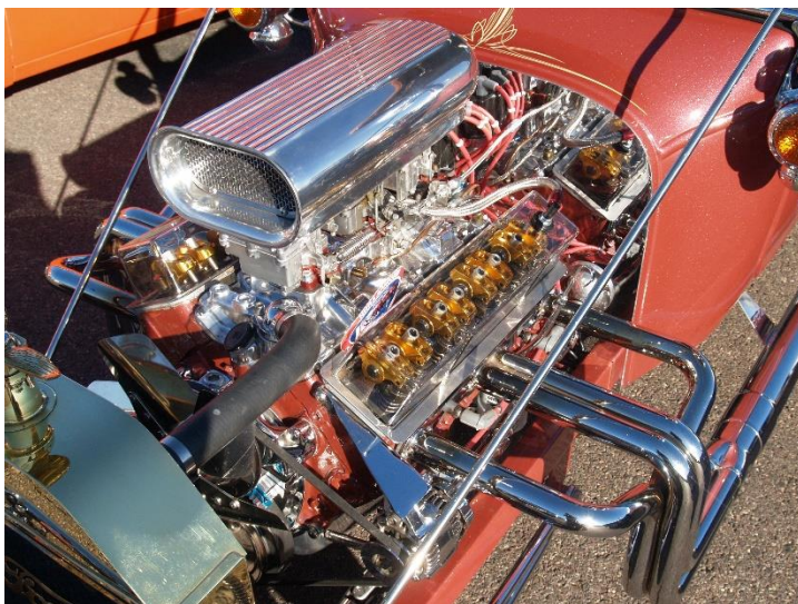
Check out those transparent valve covers