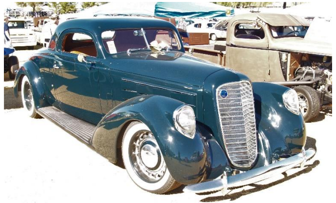
37 Lincoln model K V12 Coupe, I absolutely loved it