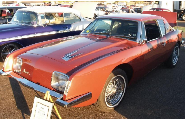
Denny's Avanti in the morning sun that was part of the adventure driving up on the 101