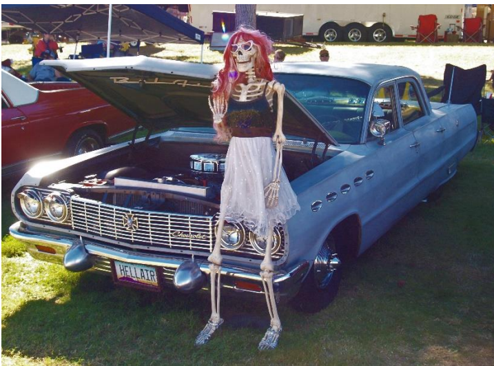
Vintage Vehicles of Sun City, Arizona