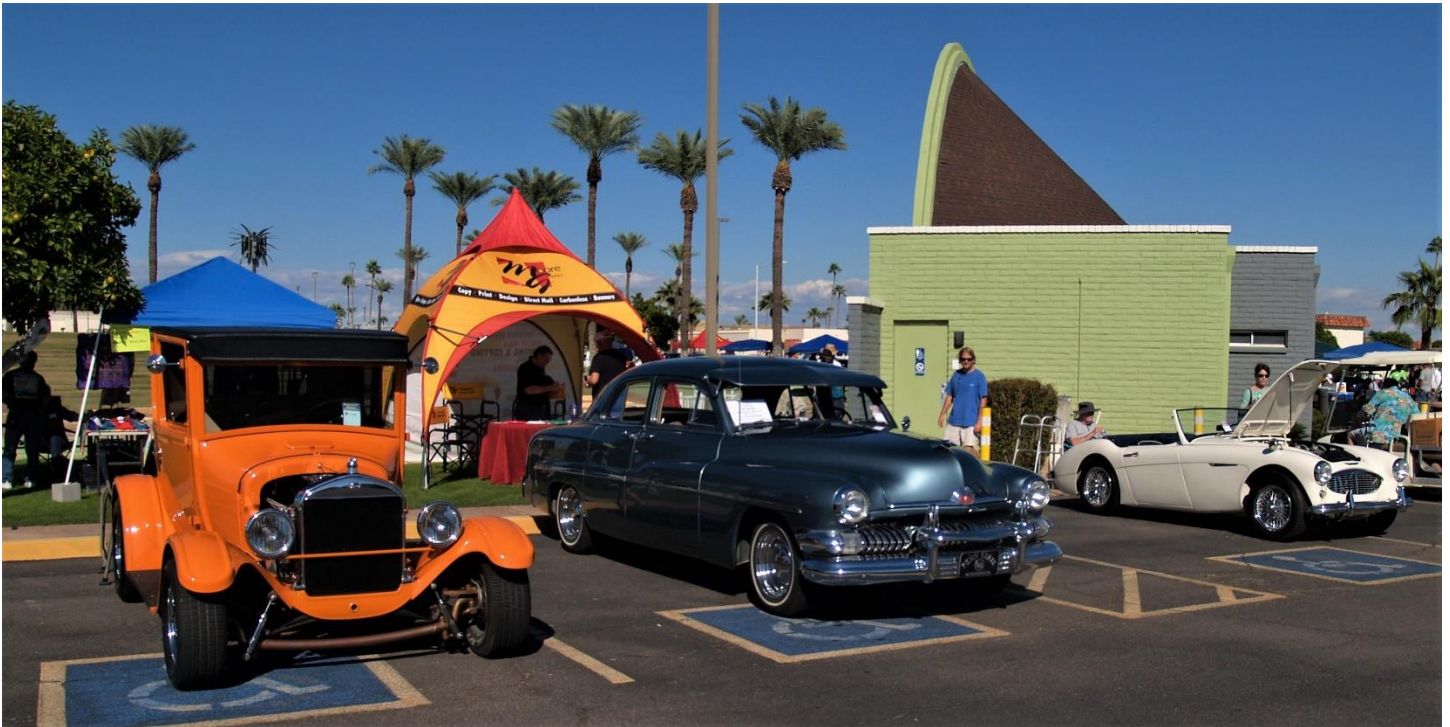
Three great looking Vintage Vehicle beside the band shell at the Sun Bowl show November. 5th

Cars, Cars, Cars! Coverage of: the Wildly Successful VVSC Last Call For Fall, and the vast, exhausting Good Guys Shows